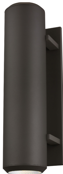
ASPENTI 20 shown in bronze

* Visit techlighting.com for specific warranty limitations and details.