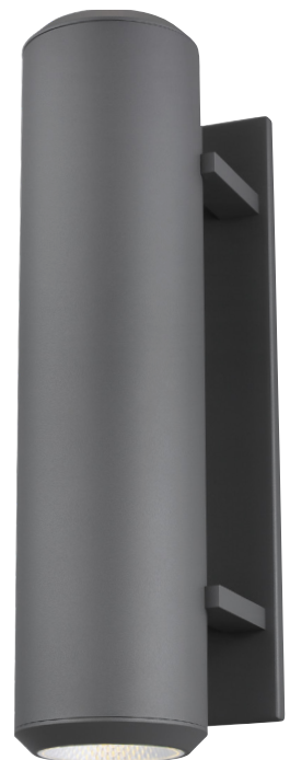
ASPENTI 20 shown in charcoal