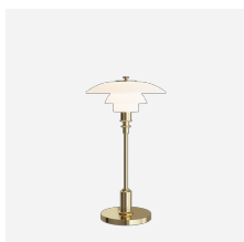
PH 2/1 Portable Lamp