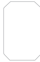
1 X CRYSTAL VESSEL