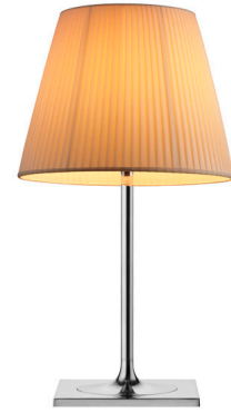
FU630307 Plisse Cloth