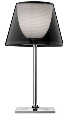
● FU627830 Chrome/Fumee