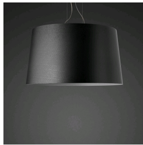
Twice as Twigggy