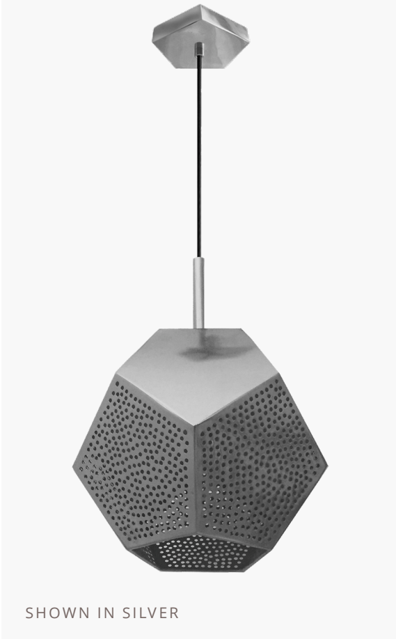
SHOWN IN SILVER

The Ula Pendant offers an intriguing, geometric design featuring a polished metal hexagonal shade. This stunning bold and angular light fixture combines geometry and intricate Moroccan craftsmanship. Designed in the USA and handmade to perfection in Morocco.