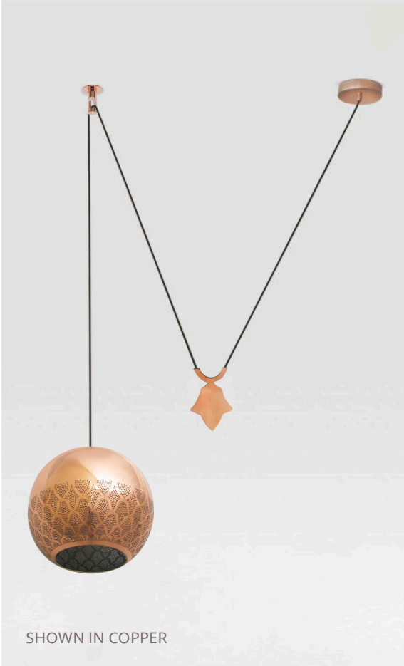
SHOWN IN COPPER