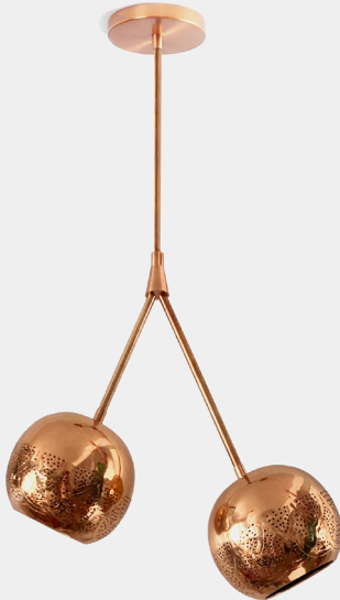
SHOWN IN COPPER

The Nur double pendant light is a perfect example of traditional Moroccan craftsmanship meeting modern forms. Suspended from one stem, its two metal globes prove that asymmetry can be achieved through simplicity and minimalism. The Nur double pendant Light is ideal for modern living and dining rooms, home offices, as well as hospitality spaces.