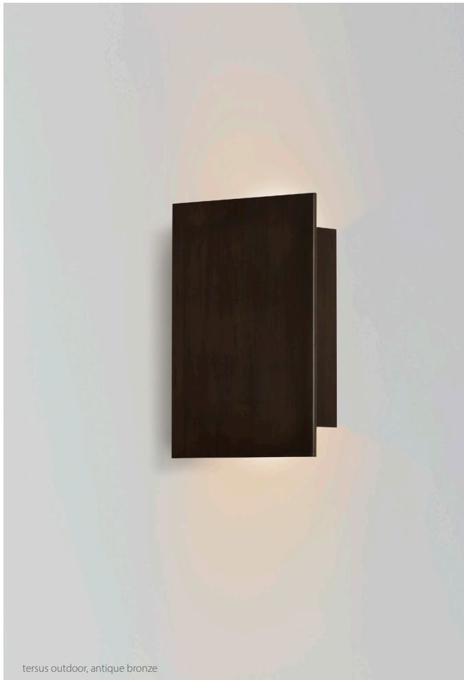
tersus outdoor, antique bronze