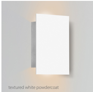
textured white powdercoat