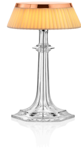
F1042015SO Copper/Plisse Cloth