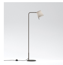
CODE: 1394037 FINISH: BRONZE

TO MAINTAIN THIS PRODUCT TO ITS BEST CONDITION, PLEASE VIEW OUR CARE AND CLEANING GUIDELINES ON THE SUPPORT SECTION OF THE ASTRO WEBSITE.