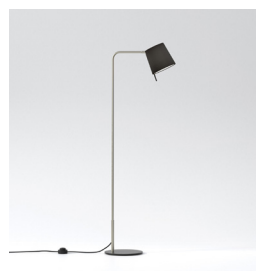
CODE: 1394033 FINISH: MATT NICKEL