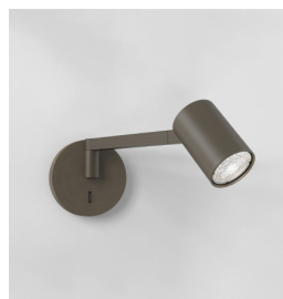
CODE: 1286070 FINISH: BRONZE