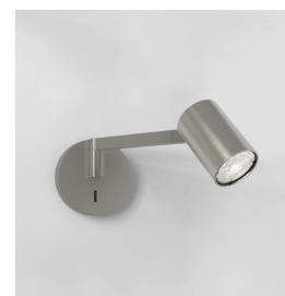
CODE: 1286069 FINISH: MATT NICKEL