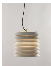
Maija 15 / 30