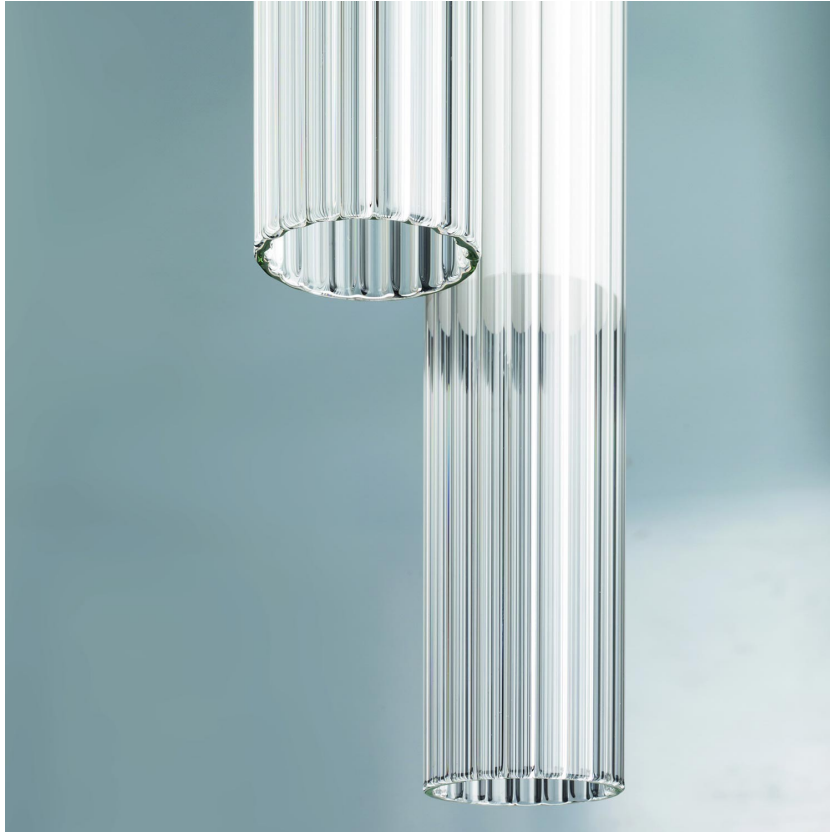
Table and pendant lamps with a diffused and dimmable light output. Fluorescent, halogen and LED sources, according to versions. Body with inner diffuser in opal polymeric (pendant LED version excluded) and outer diffuser in transparent barrel glass. Base of table version is in polished steel.