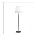
3247 FLOOR LAMP