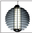
0024XXL SUSPENSION LAMP